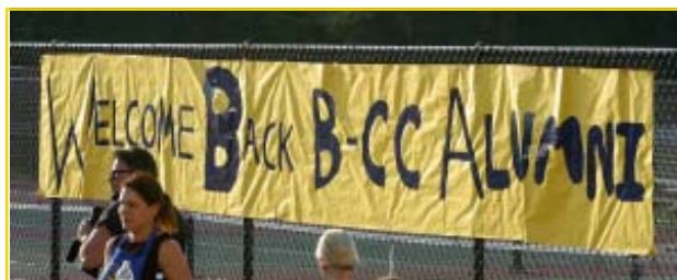
A welcome sign for alumni by B-CC students

For the first time in many years, our B-CC neighbors were able to enjoy the spirited homecoming parade right in front of their houses. With vehicles no longer allowed inside the B-CC stadium because of the newly installed track, the